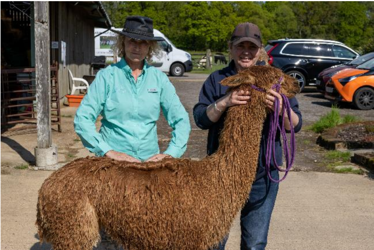
King Arthur mid side fleece