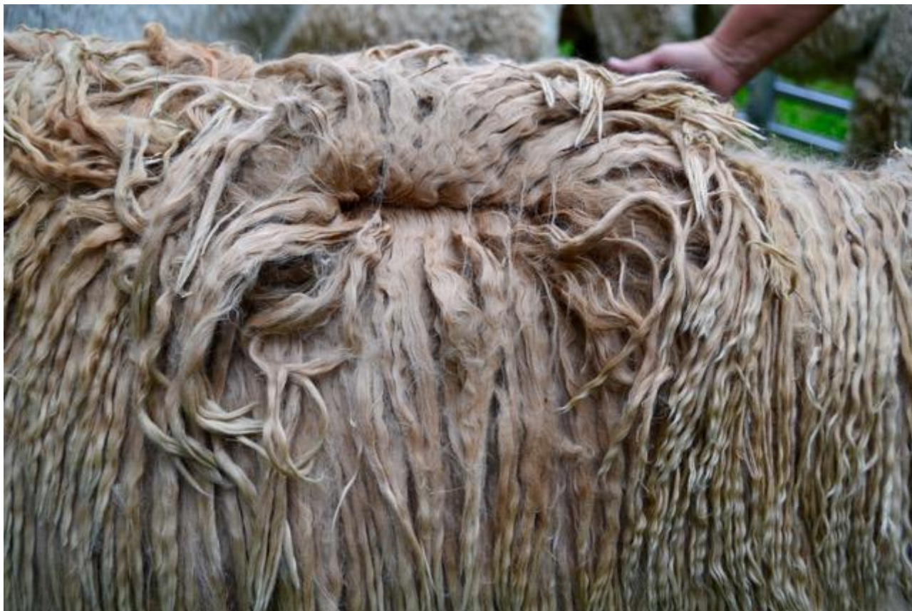
Tolstoy on halter