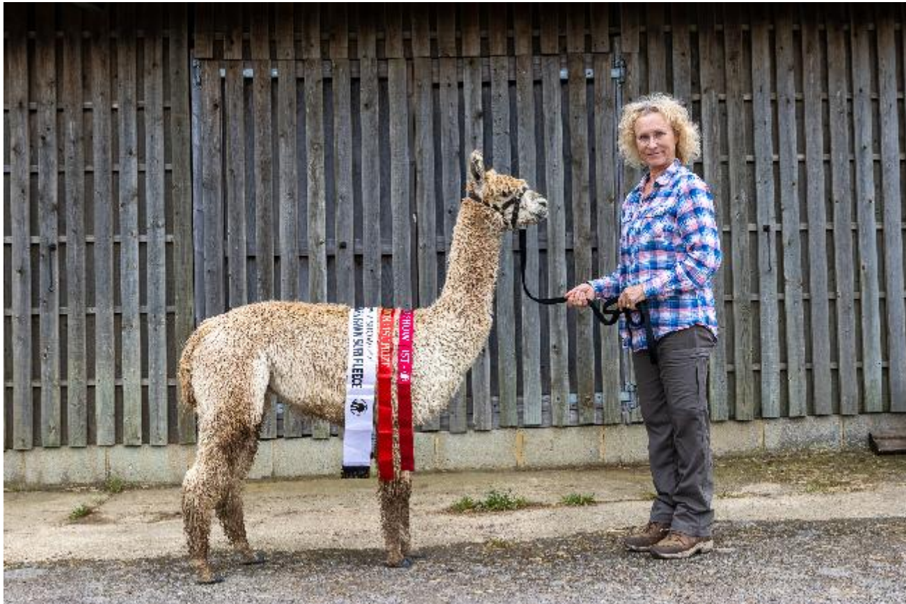
Tolstoy with NZ Sash