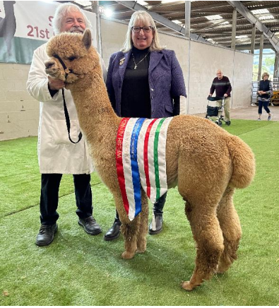
Jack the Lad Supreme and Best of British Midlands 2022