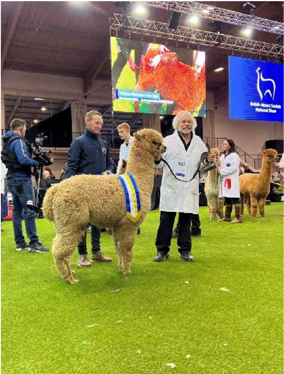
Jack the Lad Champion Fawn Male National 2023