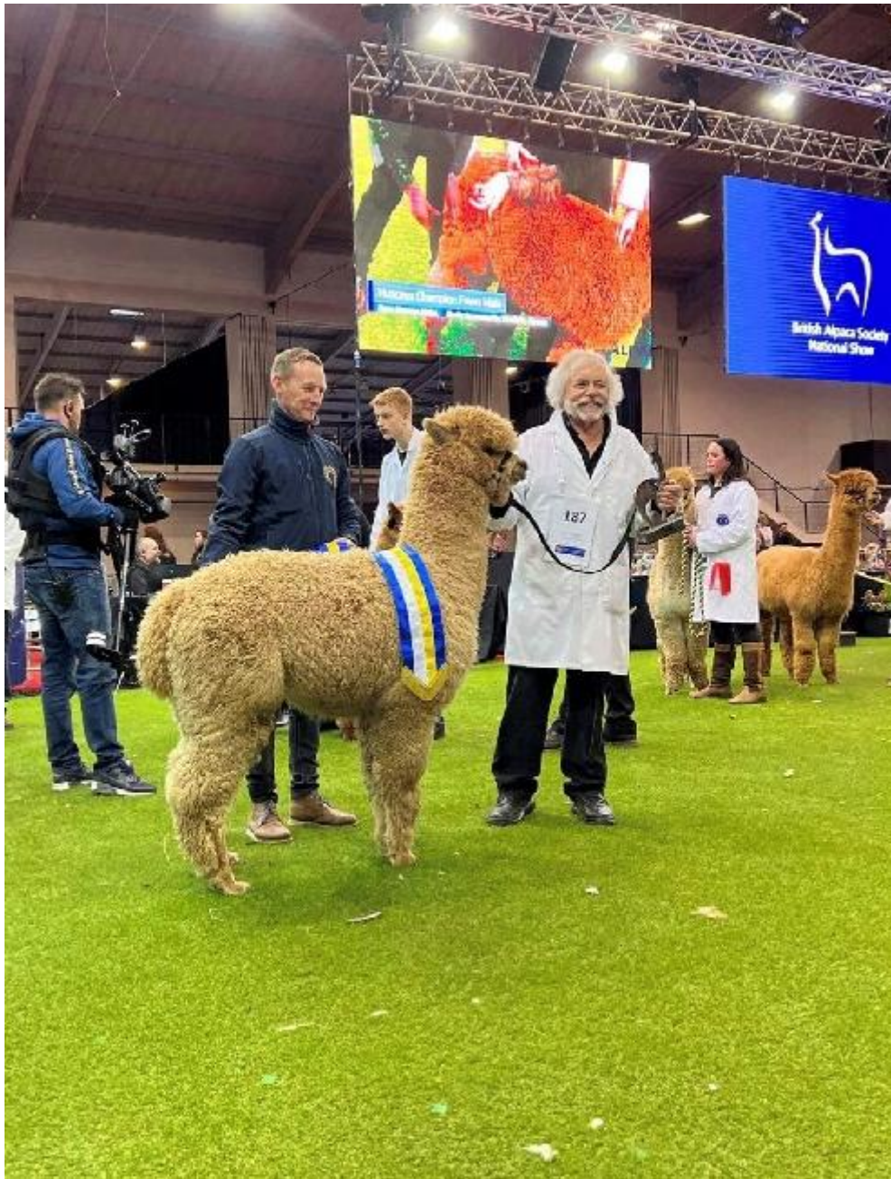
Jack the Lad Champion Fawn Male National 2023