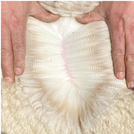
Ron September 2023 (4 years)