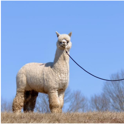
Rons second fleece