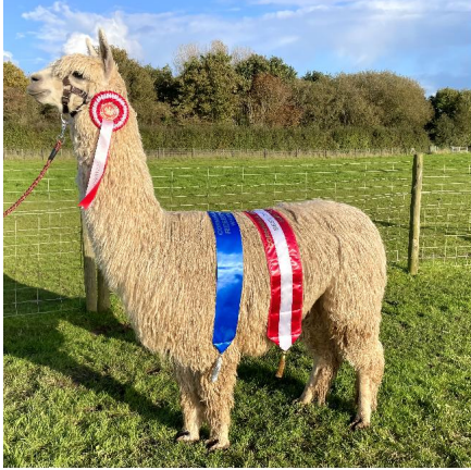
Alpaca Photo 2