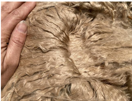
Alpaca Photo 3