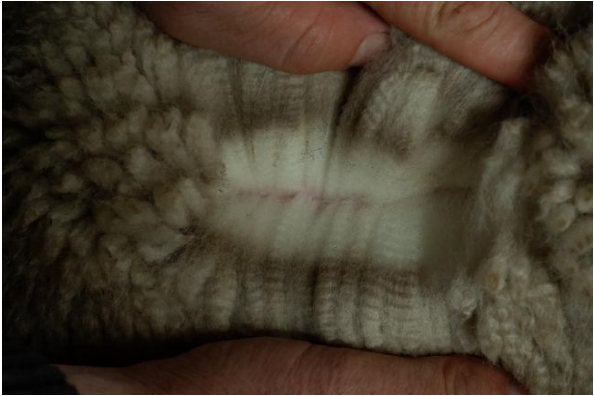
winning reserve supreme at CCA