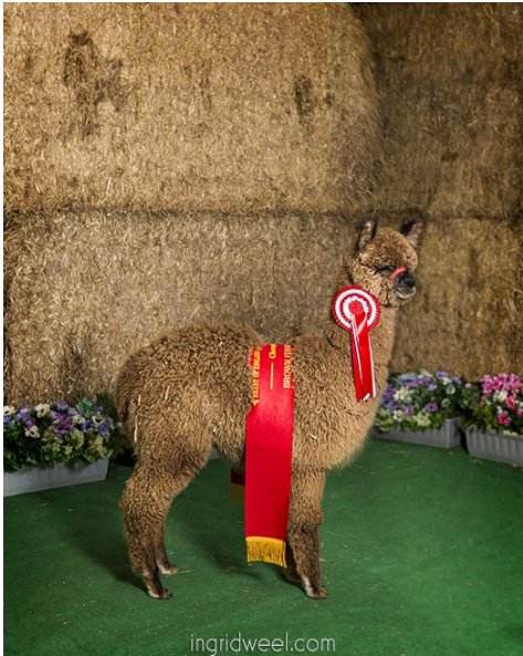
Arkadia Uptown Girl