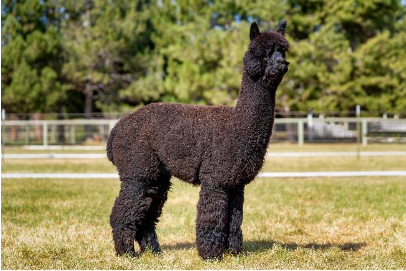
Alpaca Photo 1

2022: 19,2 Micron - SD 3,8 - CEM 7.8 - CRV 35.2 - CF 98.6%