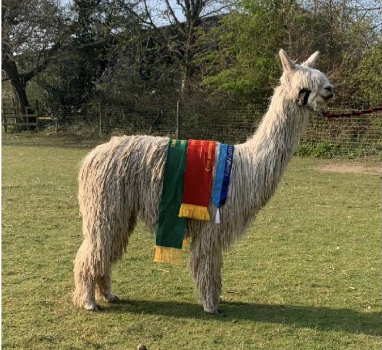
Alpaca Photo 1

Three Counties Fleece Show - 1st and Champion Light