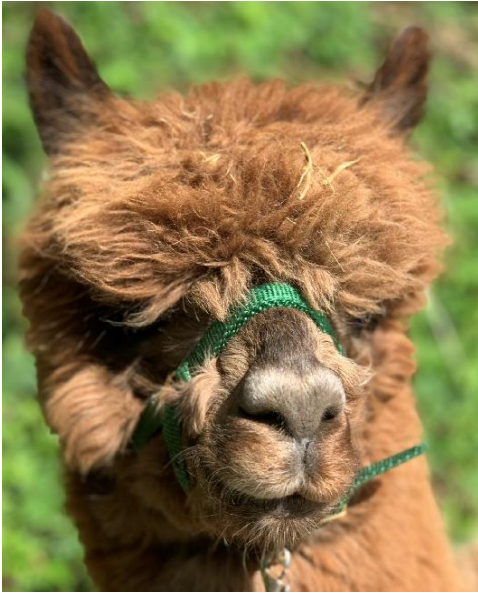
Alpaca Photo 3