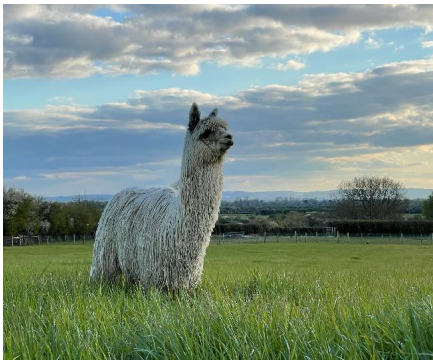
Progeny - 2023 BAS National female champion grey