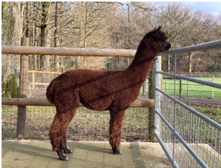
Redens Churchill Fleece March 2021