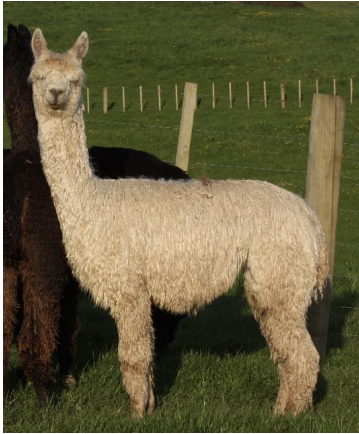
Alpaca Photo 2