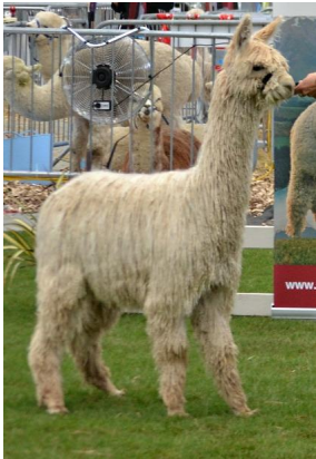
Alpaca Photo 3