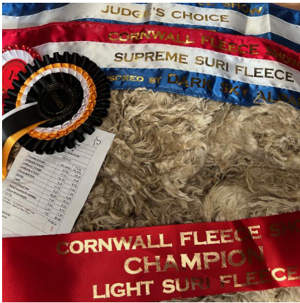
Lorient's progeny, Dark Sky Du Maurier with Supreme & Champion sashes 2023