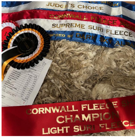
Lorient's progeny, Dark Sky Du Maurier with Supreme & Champion sashes 2023