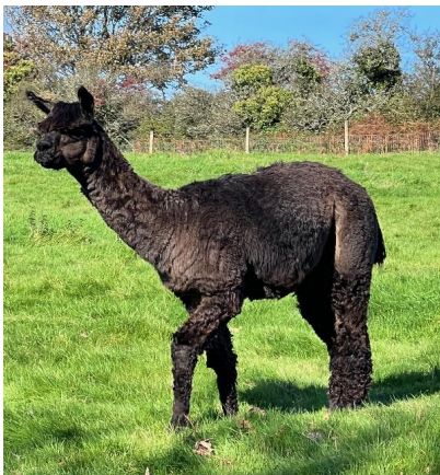
Borasco's progeny, Dark Sky Hross with Champion sashes from 2023