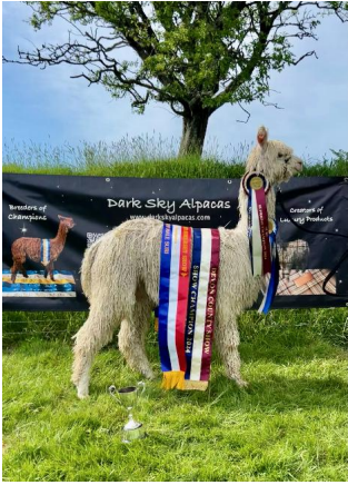
Dark Sky Kahlua - one of Bolero's 2021 progeny