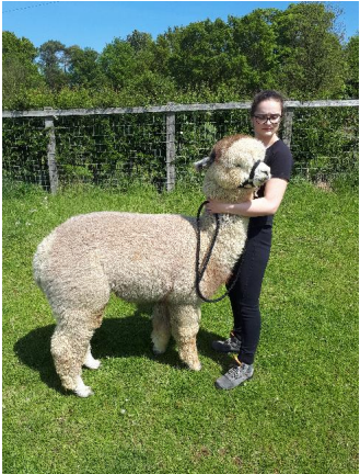
Blaine covering HA Mrs Pepper Pot 2019