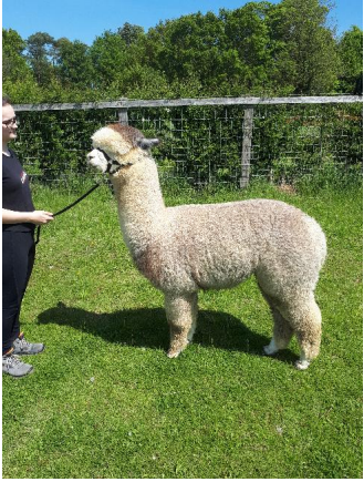
Blaine May 2019