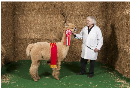
Velvet Voyager 1st UK Nats 2018