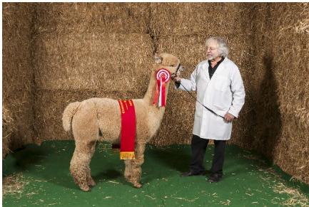
Velvet Voyager 1st UK Nats 2018