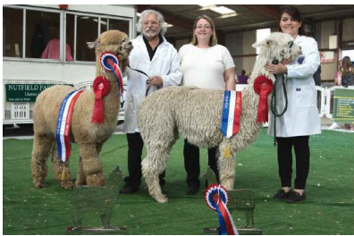
Velvet Voyager HoE Champion