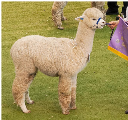
Alpaca Photo 3