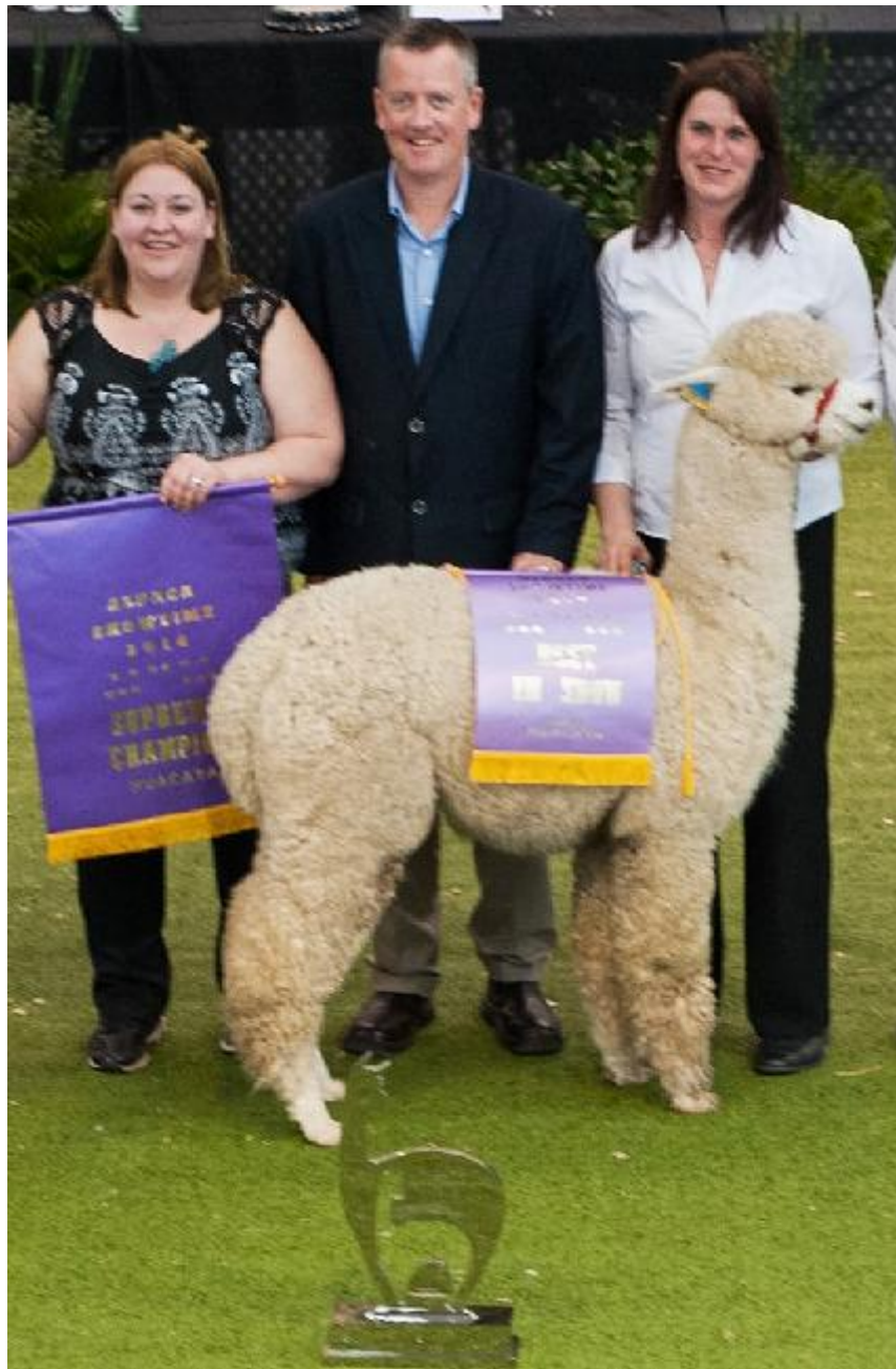
Alpaca Photo 1

2014: Alpaca Showtime - Supreme Champion