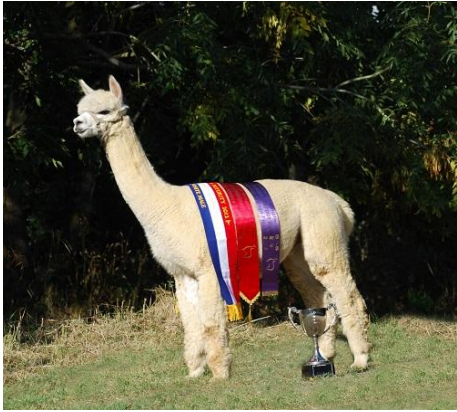
Alpaca Photo 1