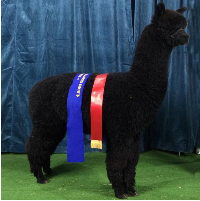
Wyona Casa Nero at Royal Sydney Show 2014