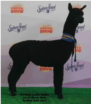
Wyona Casa Nero Fleece aged 18 months