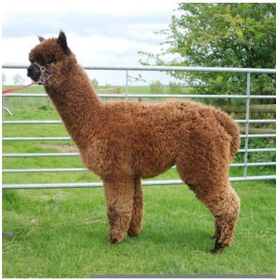
Toft Timogen Fleece