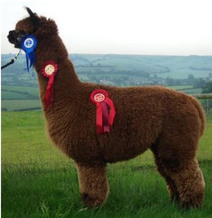
Inca Darwin 1

2010 Heart of England – 4th brown junior male