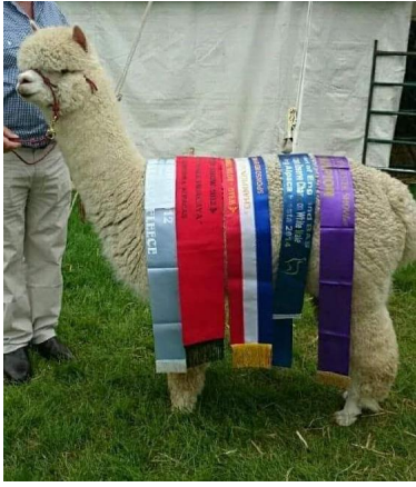
Alpaca Photo 2