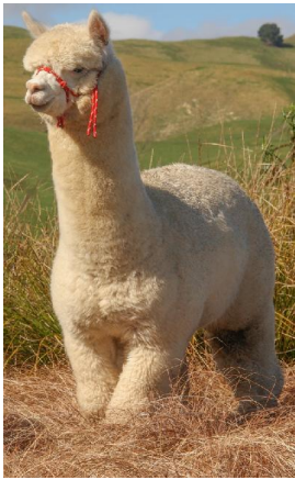
Alpaca Photo 3