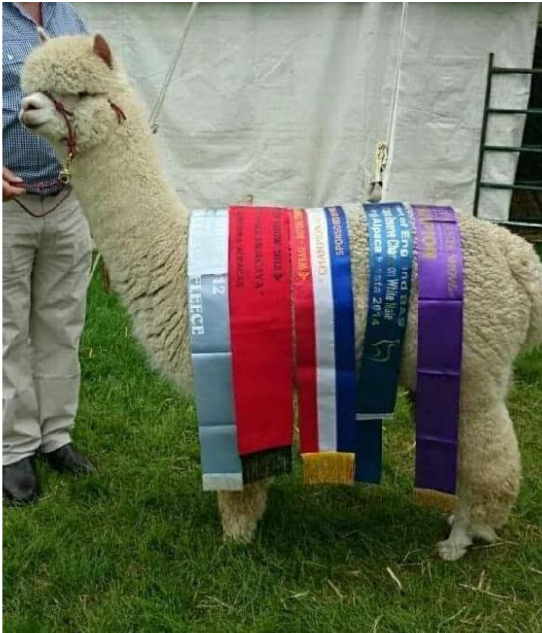
Alpaca Photo 1