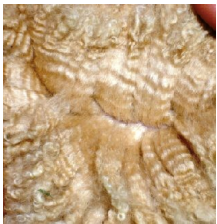
Sandstorm April 2013