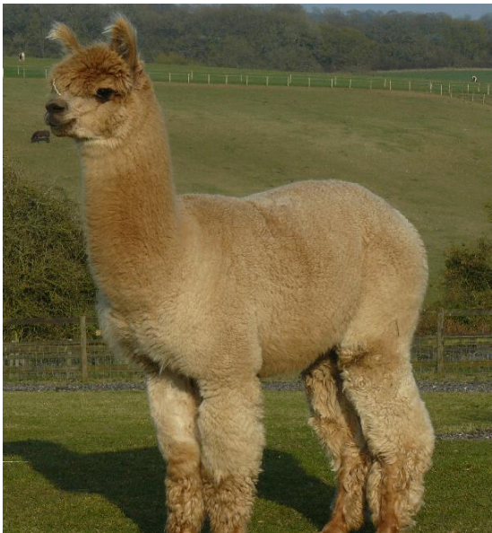
Classical Ajax 11 in full fleece