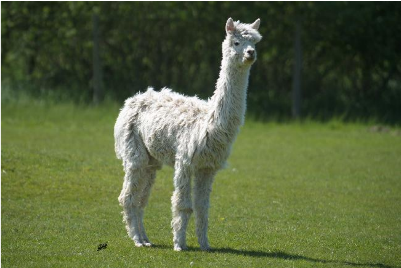
Alpaca Photo 2