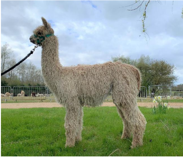
K115 Heirloom 2024