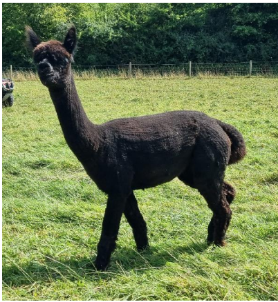
Alpaca Photo 2