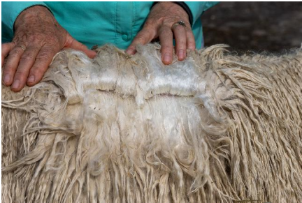
Best British Suri BAS National 2023