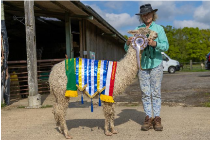
Blizzard's stunning fleece