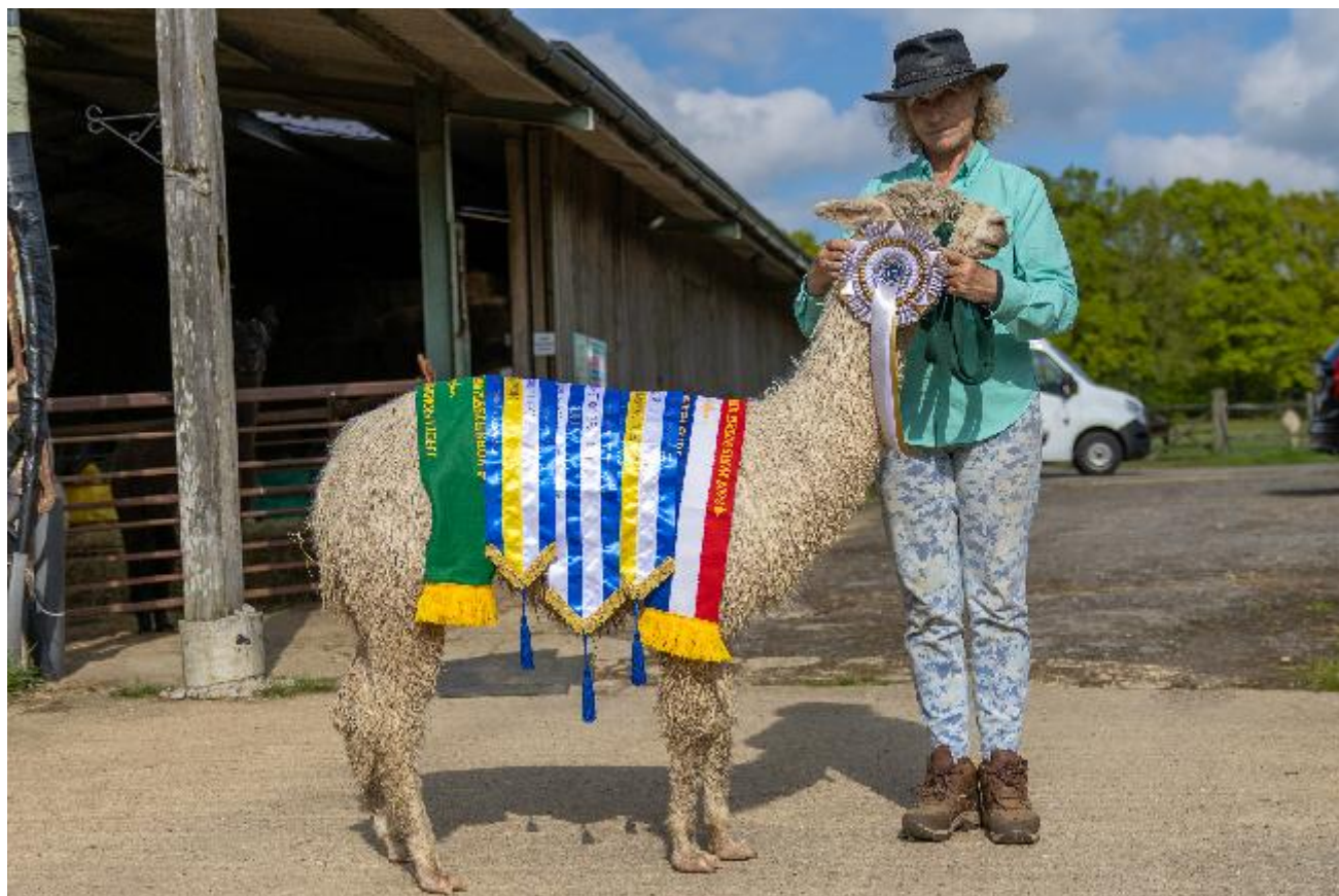
Blizzard - multiple Champion