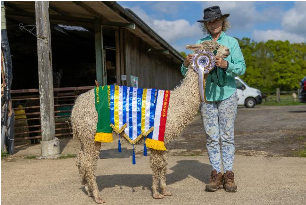
Blizzard - multiple Champion