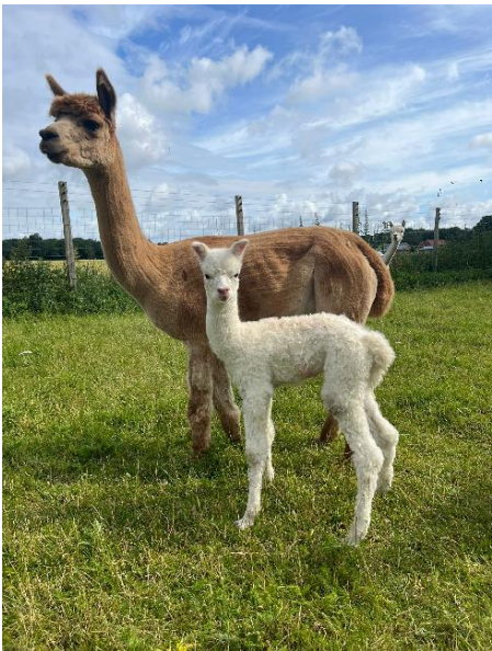
PRO Sari, 3. Vlies