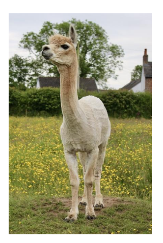
Alpaca Photo 2