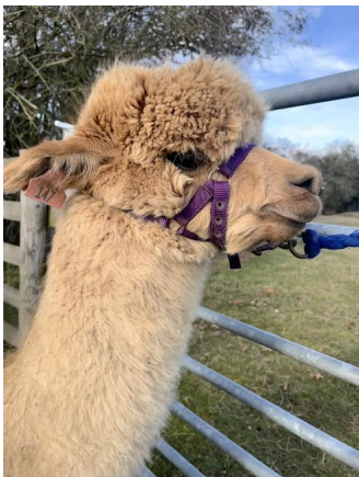
Alpaca Photo 3