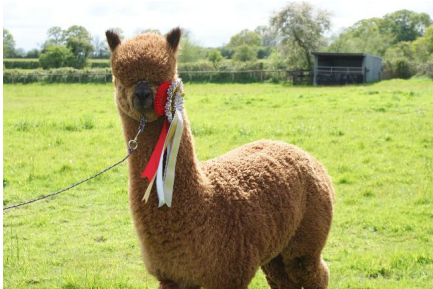
WILLOWBROOK BROWN SUGAR (11 MONTHS FLEECE)