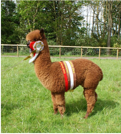
WILLOWBROOK BROWN SUGAR