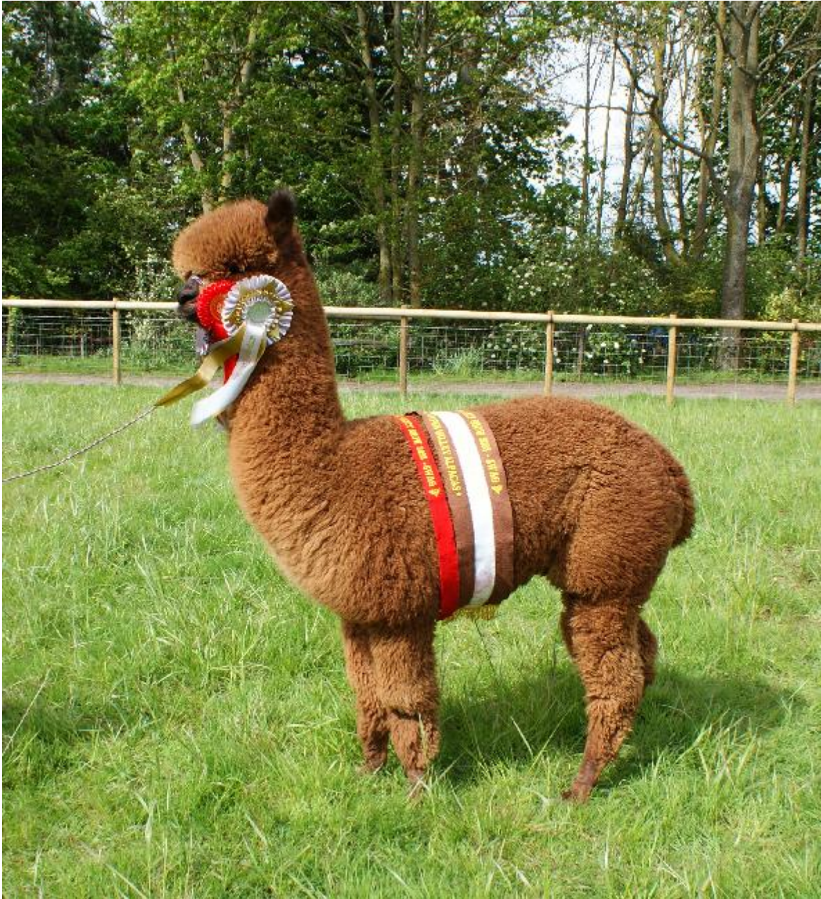
WILLOWBROOK BROWN SUGAR