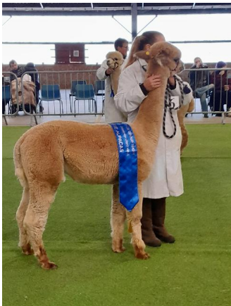
Alchemist spring 2024