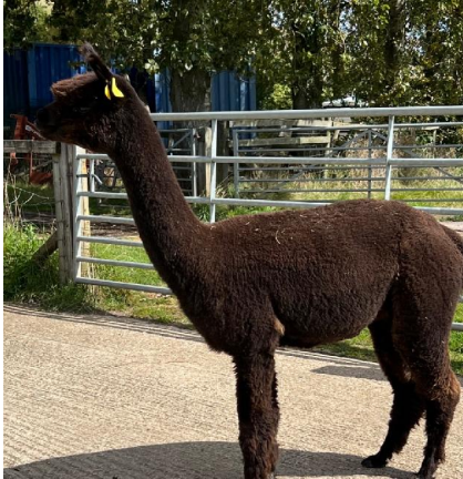
Bear and her female cria 2024