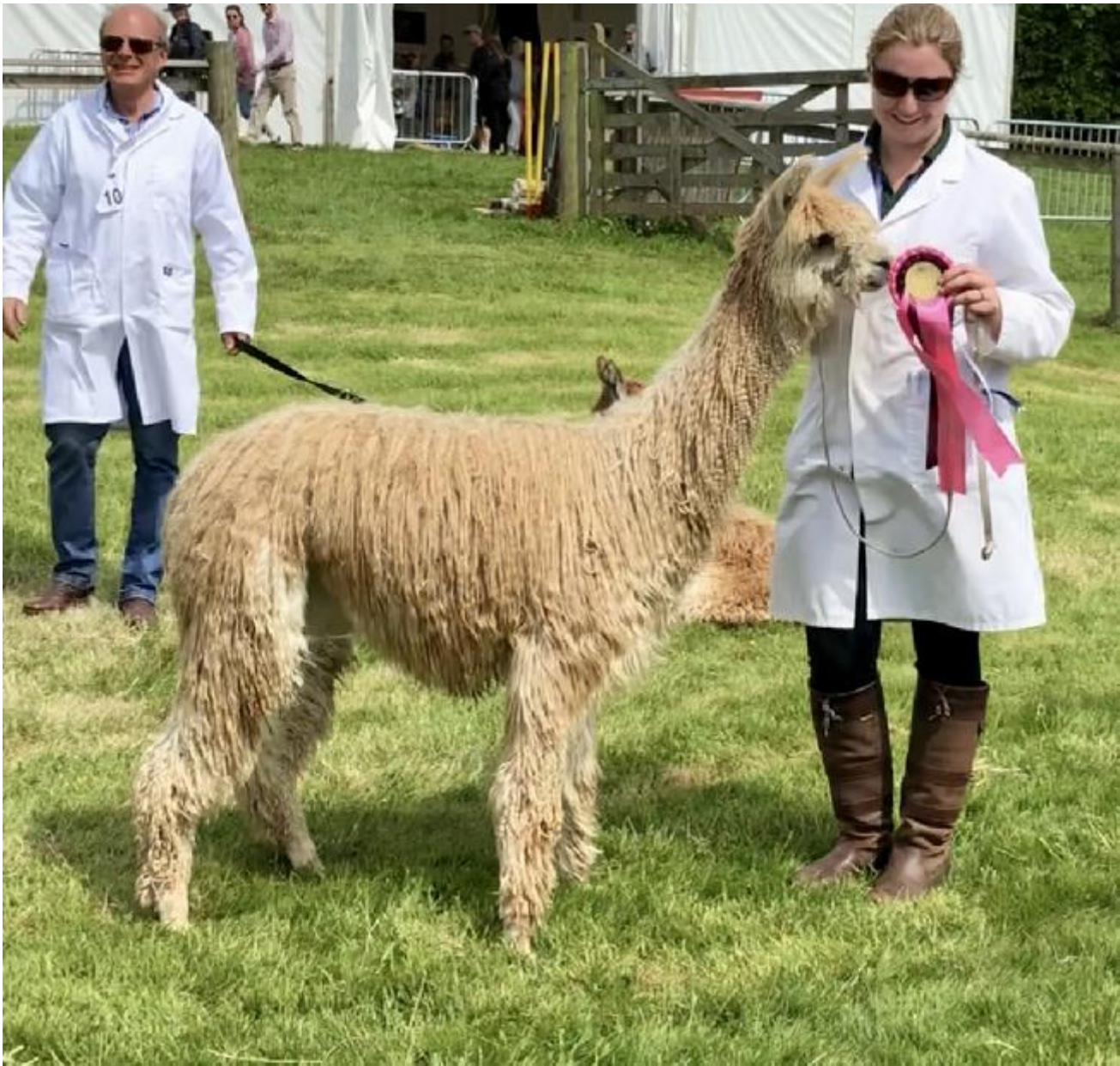
Sunsprite - Reserve Champion