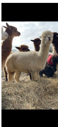
Alpaca Photo 2