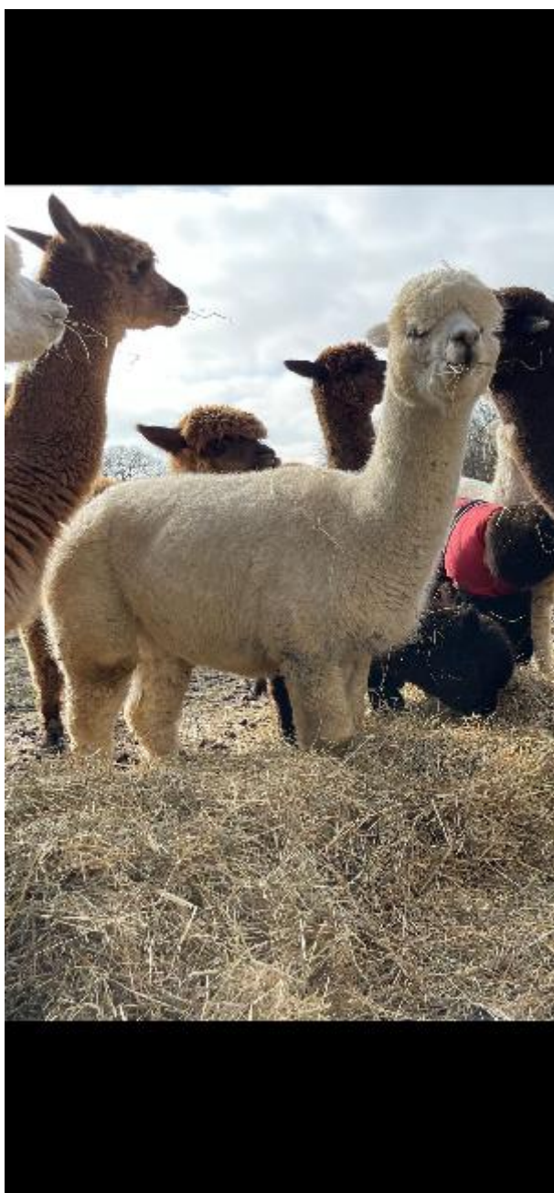
Alpaca Photo 1