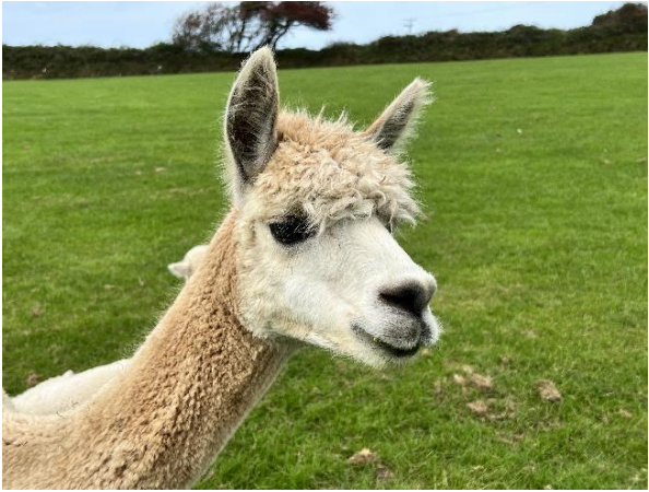
Mullacott Lotus Flower