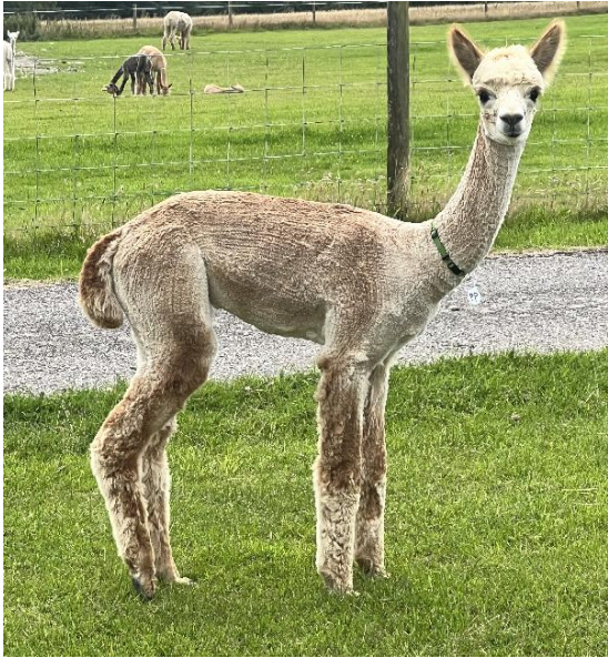
Pumpkin Pie and mum Dahlia