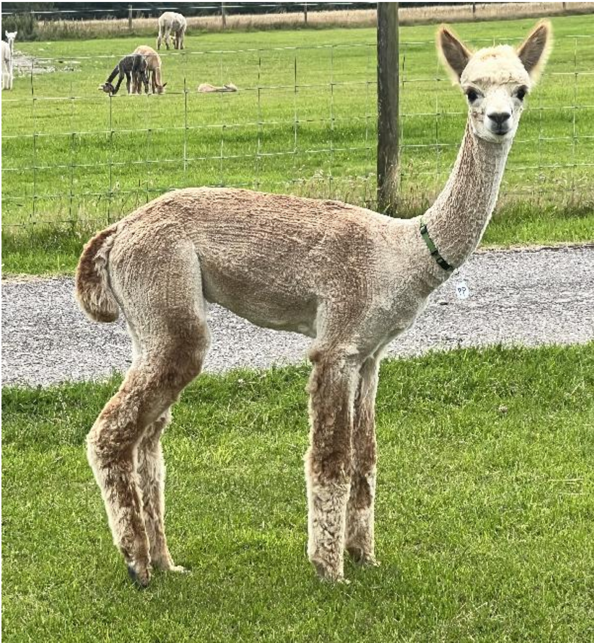
Mullacott Pumpkin Pie