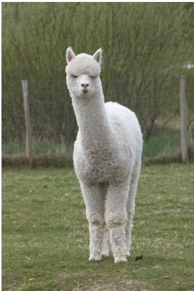
Alpaca Photo 3