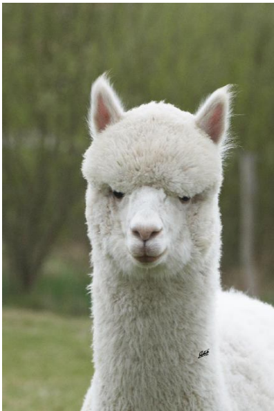
Alpaca Photo 2