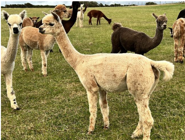
Mullacott Pi head