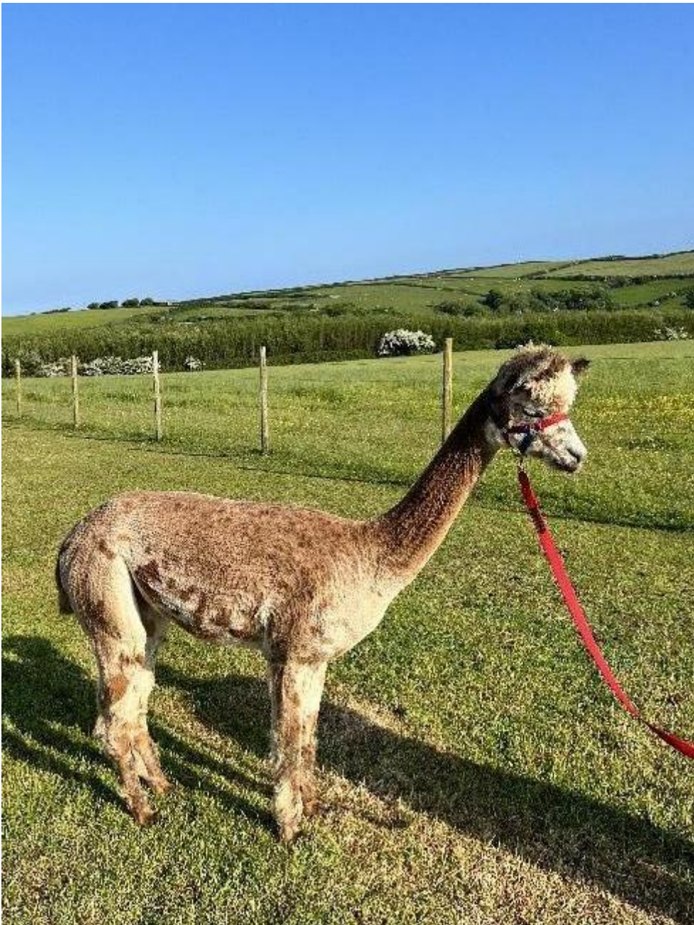
Mullacott Polka Dot